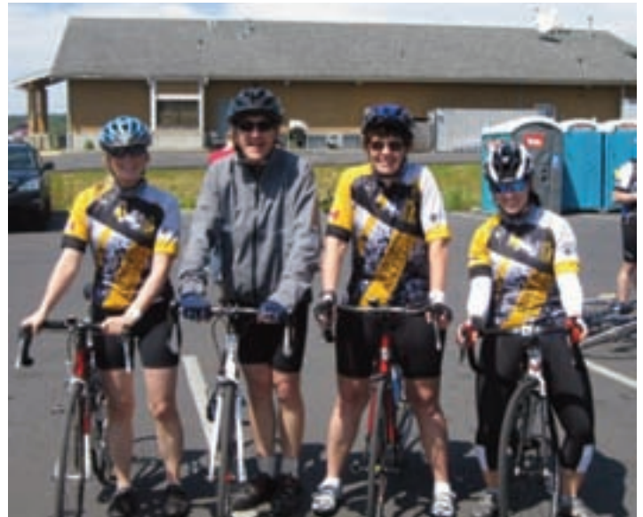
OT Consultants - Ride to Conquer Cancer

You are invited to consider a Consulting career with Progressive Rehab-OrionHealth